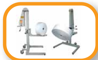
Roll Handling and Die Lifting Equipment