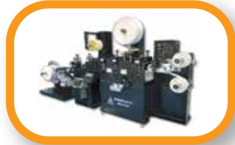
Modular Rotary Die Cutting and Finishing Systems