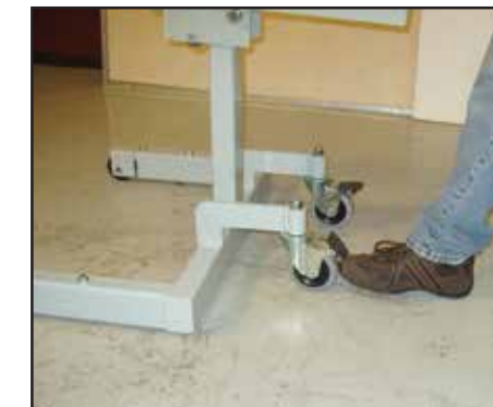
Toe activated wheel safety brake to secure cart in desired position