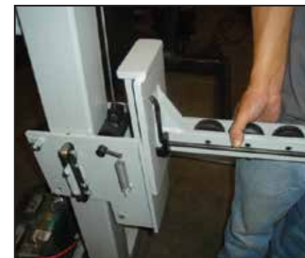
E-Z Change attachments are easily installed and removed