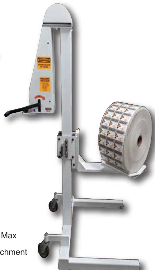
MH-800 Series 800 lb. (362 Kg) Max lift shown with 360° Swivel attachment