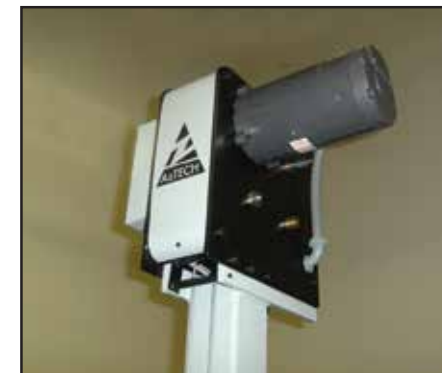
Heavy-Duty transmission standard on all powered MH-800 and MH-1500 models