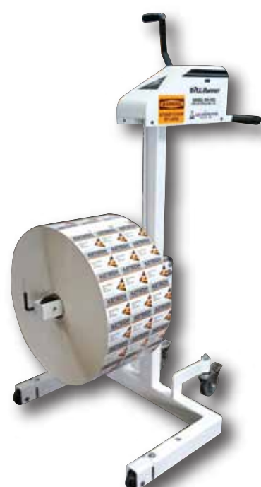
MH-400 Series 400 lb. (181Kg) Max lift shown with Roller Core attachment