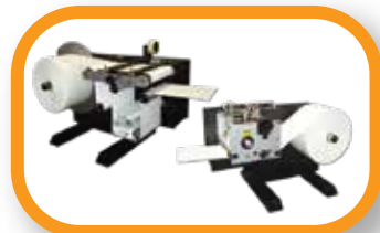
Unwind and Rewind Modules