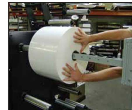
Easily load and remove rolls utilizing roller core attachment