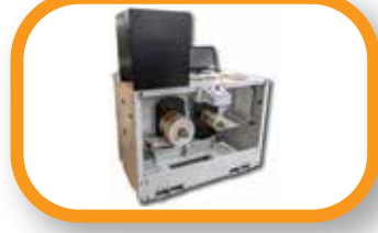
Bi-Directional Inspection Rewinders