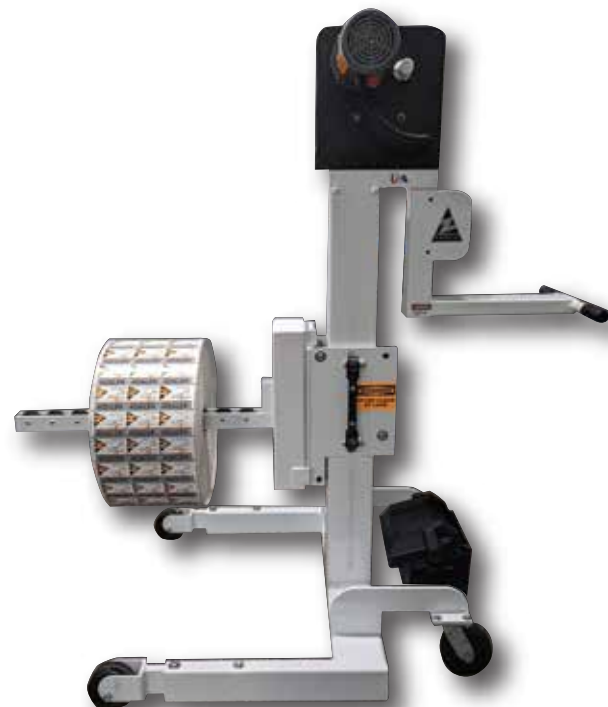
MH-1500 Series 1500 lb. (680 Kg) Max lift shown with Roller Core attachment and powered lift