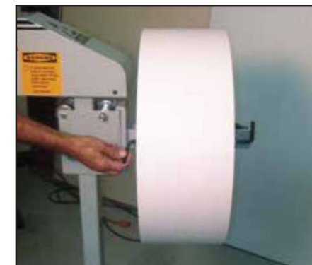
Manually activated roll stop to prevent roll from falling off attachment