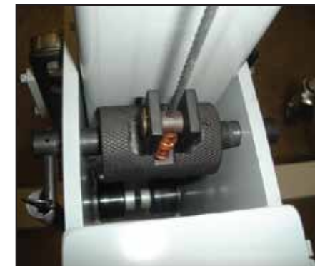
Automatically activated safety brake to prevent load drop in event of cable breakage