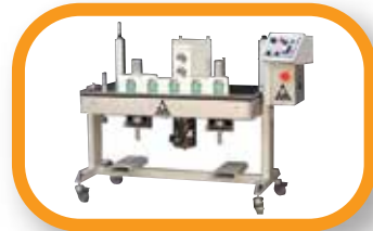
Invertible 90 degree Table Top Rewinders