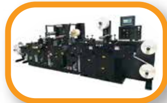
Modular Semi-Rotary Die Cutting Finishing Systems